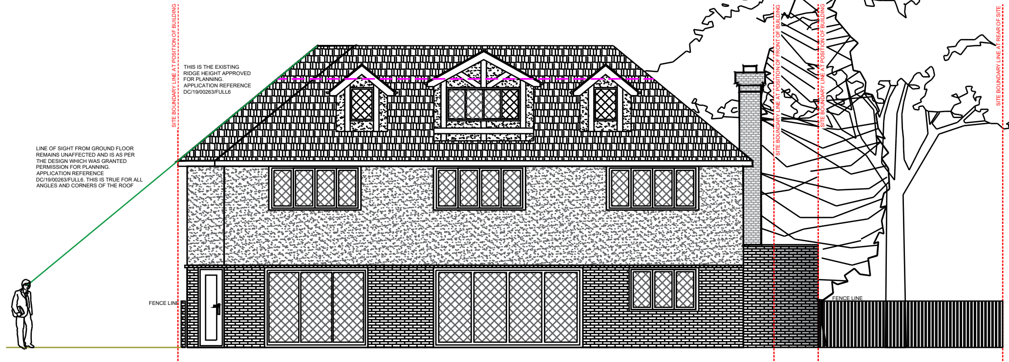
PROPOSED ELEVATION B-B

LINE OF SIGHT FROM GROUND FLOOR REMAINS UNAFFECTED AND IS AS PER THE DESIGN WHICH WAS GRANTED PERMISSION FOR PLANNING. APPLICATION REFERENCE DC/19/00263/FULL6. THIS IS TRUE FOR ALL ANGLES AND CORNERS OF THE ROOF